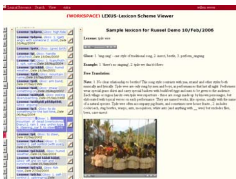
This figure shows a list of lexical entries in a form that can be determined by the researcher and it gives more information including multimedia streams for a selected entry. Also the way this information is presented can be defined by the user.

encoding is not consistent in general. Often, some pre-processing is required to filter out inconsistencies.